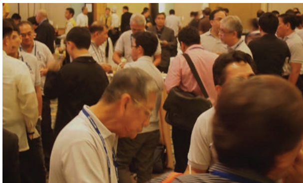
POA delegates wearing the POA shirt during the Fellowship Night