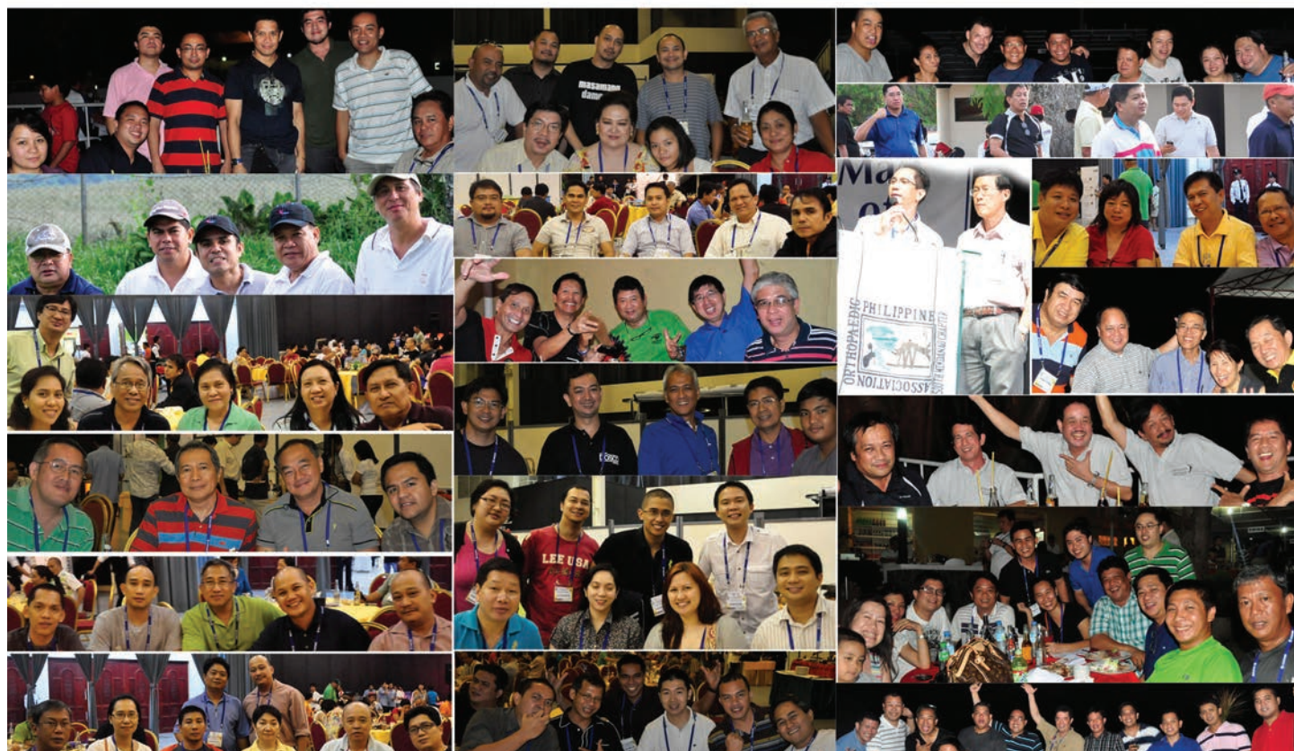
Various pictures taken during the POA 22nd POA Midyear Convention