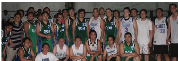
Players pose after the championship games