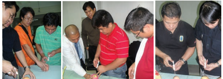
The participants during the hands-on session (Core needle biopsy exercise)

Santoson during her lecture on the Role of Chemotherapy in Malignant Bone Tumors