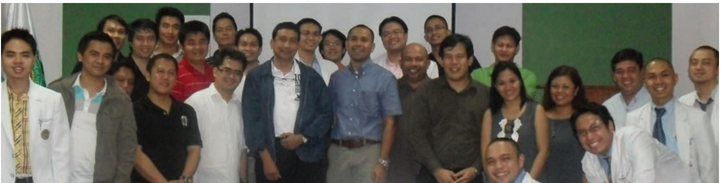
The lecturers, organizers and participants pose after the successful workshop