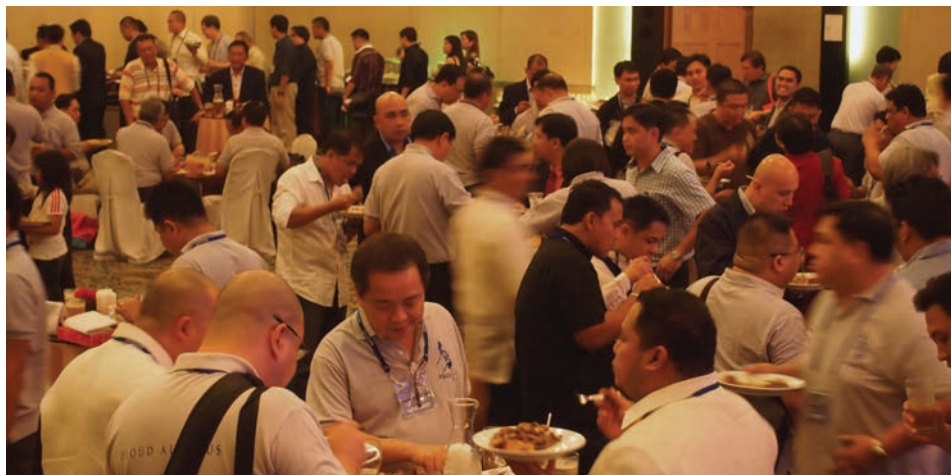
Delegates enjoying the Filipino food during the Fellowship Night

I am truly lucky to be in this time and place. Proud to be your leader this past year standing on the shoulders of giants that went before me. One day I may fade away like the mainframe and become too a forefather but that will not scare me.