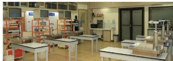
The UST Hospital Orthopaedic Learning Center

as the Director of the USTH Orthopaedic Learning Center.