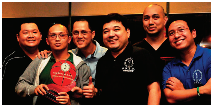
The POC team being given their championship trophy for the recently concluded basketball tournament.

Aside from continuing their yearly activities and making new ones, the organization wishes to finally include other residents from North Luzon, Visayas and Mindanao in their future activities as ever planned. It is but our vision to have one united, absolutely-fixed nation-wide residents' organization for we can see more its benefits when we become consultants for referrals among our areas of practice. And besides, the POA fellows' bond will be much stronger if it has been preemptively established beforehand during residency.