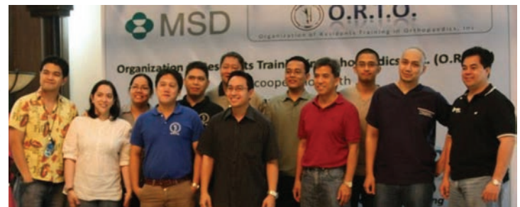
Officers pose with the speakers during the ORTO Forum