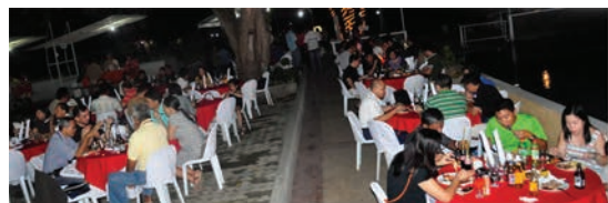
The Fellowship Night