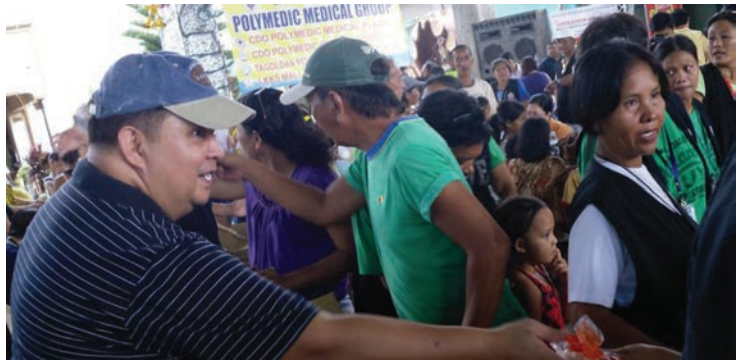
Building of shower areas for the evacuees of Tibasak, CDO