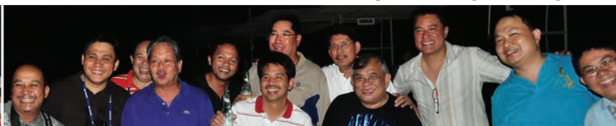
Host POA South Mindanao Chapter members